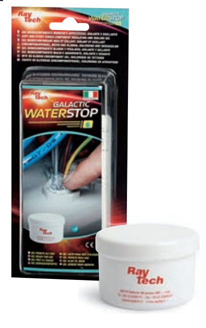
Kit composition: 2 cans, 100 g each